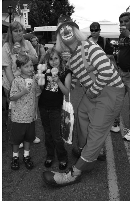
CLOWNING AROUND - Young visitors enjoy entertainment and refreshments at the Newton Day Festival.

Events during the day included a Karaoke contest, Just for Fun Dog Show, Kofi Drum Circle, and Snakes, Snails, & Turtle Tales, along with about 90 booths selling food, trinkets, and offering information. At Memory Park in the evening the Miss Newton Contest, and Little Miss and Mister Newton Contest was held. As folks enjoyed the music of The Blue Emerald Band, rides were given on the Itty Bitty Fire Truck and the children enjoyed making wax hands and sand art. Of course the highlight of the evening was the Fireworks display.